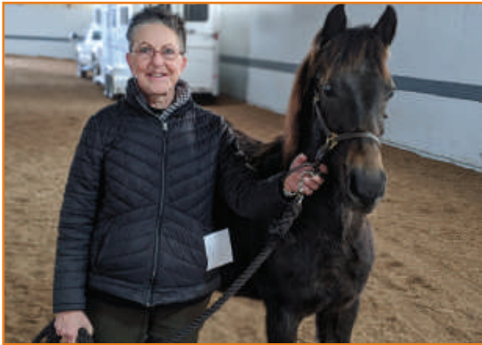
Shooting survivor Knox with his adopter

Meet some of our recently adopted animals and pets in foster homes.