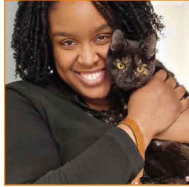
Scarlet's "mom" was all smiles