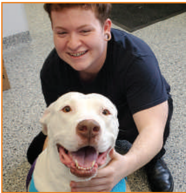
Sky, a long-term resident, adopted