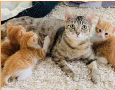
Mia and her kittens in foster