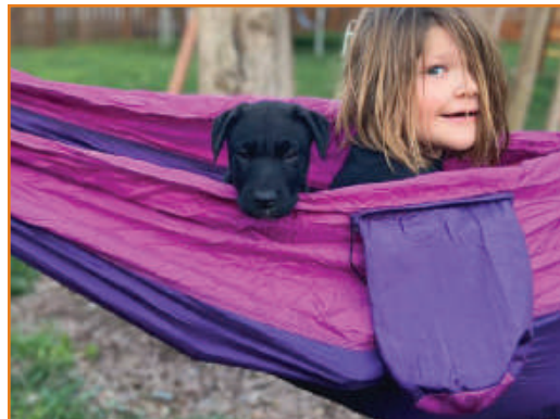
Tigger the puppy and Vivian enjoy the backyard