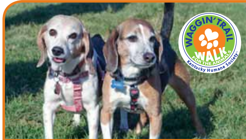
Jimmy and Sissy say "join us for Waggin' Trail!"

So what are you waiting for? Register online today at kyhumane.org/wtrail . 🐾