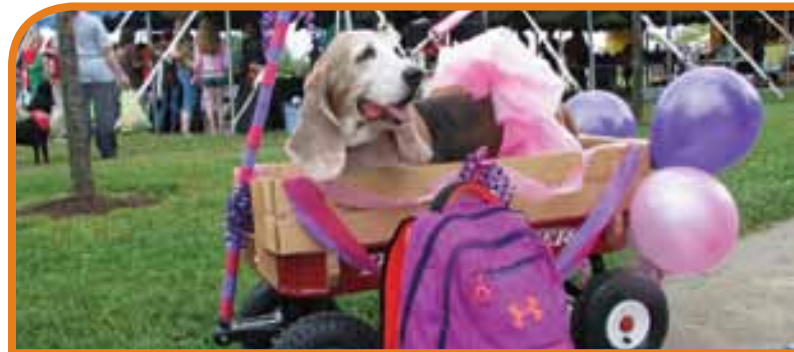
Come for the walk; stay for the festival!