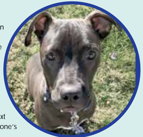
Dante came through surgery and is happily recuperating.

Dante went to Purdue University’s Veterinarian College to have the surgery done. He came through the surgery and is already joyfully bouncing and playing with his foster family. His prognosis is good, and he will soon be ready to take on his next challenge: being someone’s forever dog. 🐾