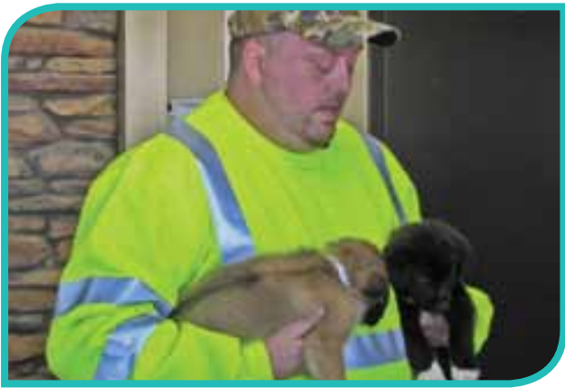
Puppies with their rescuer

were no video cameras or witnesses, so the officers had little information to go on. Local media also asked witnesses to come forward with information, but no one did.