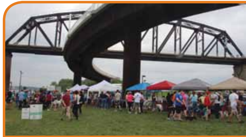
The Waterfront's Big Four Lawn is a great place to celebrate.